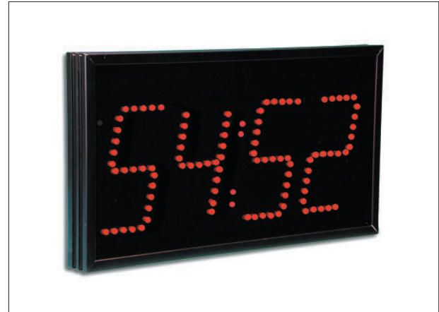
Microframe® Model 940 Display

The Remote Display is designed to operate with the Model 904 Keypad or Model 6200 Timer Keypad. The Remote Display receives power and signal from a single cable connected to the Keypad and is turned on or off with the Keypad power switch.