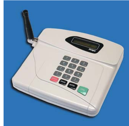
DataPage II Transmitter

The DataPage II Transmitter can send a 12-digit numeric message code to any of 9,999 different pagers. Upon request, Microframe can program up to three pre-defined alpha messages to enhance communication between the sender and receiver. This on-premise paging system offers unlimited paging with no monthly service fee. Optional Telephone Interface allows any internal phone to be used for paging. Optional computer interface allows messages to be sent from any network computer. May be set on a flat surface or installed on a mounting wedge for an angle or wall-mount.