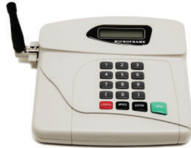
DataPage II w/DTMF Transmitter

The DataPage II w/DTMF can send a 12-digit numeric message code to any of 9,999 different pagers. When used with the GEO 40 Alpha Pager, Microframe can program pre-defined alpha messages to enhance communication between the sender and receiver. Up to 874 total characters may be used, making it possible to program as many different messages as you want within that character limit. Every space counts as a character, as does every line. For example, you could pre-define 45 messages that are 2-5 words in length or 70 two-word messages. All pre-defined messages are programmed at the time of initial order.