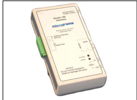
Microframe® Model 190 Interface

Once a number is entered into the Keypad, the number is sent immediately both to the Display and the TV.